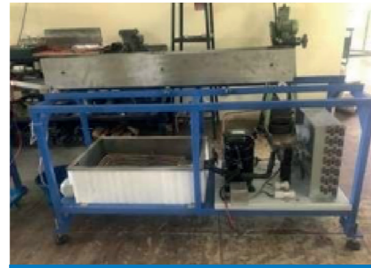
Plastics Filament Chiller

The Eco system to convert plastics to pellets, pellets to filaments and use the filaments for 3D printing useful objects