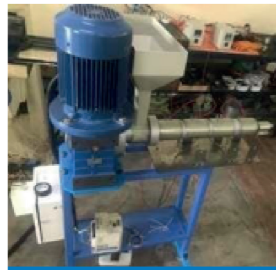
Plastics Filament Extruder